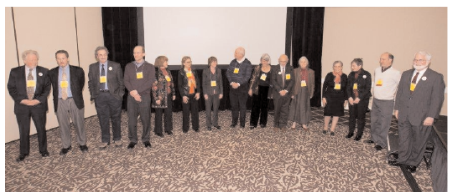
Members of the Campaign Committee are honored at the Plenary Session of the 2013 Annual Meeting.

*Member of Campaign Steering Committee †Deceased